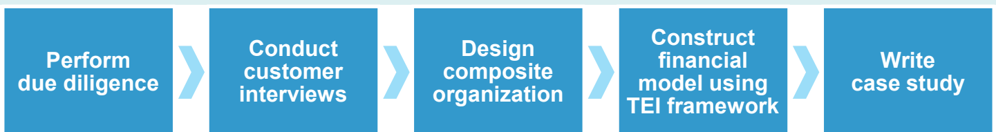
FIGURE 2 TEI Approach

Given the increasing sophistication that enterprises have regarding ROI analyses related to technology investments, Forrester's TEI methodology serves to provide a complete picture of the total economic impact of purchase decisions. Please see Appendix B for additional information on the TEI methodology.